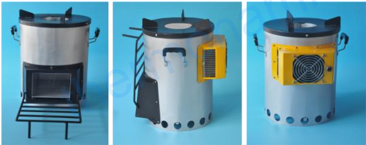
Outlook of the generator which with the outputs: 5 VDC USB

The unique biomass stove is designed not only to improve the cooking conditions and increase burning efficiency for fuel saving, but also come with a 10 watts thermoelectric generator for lighting during cooking and mobile phone or battery charging to improve life style. With special air flow arrangement in design, the stove can provide just enough air combustion to reduce smoke by natural ventilation and to save the fuel (the fuel could be wood, straw, animal dung, coal, etc.). Taping the thermoelectric technology, the small generator built into the stove can generate the electricity during the cooking by utilizing a small heat from the stove. The generator of the stove includes thermoelectric modules, fan, heat collector and heat sink. The thermoelectric modules will turn a bit of heat from the stove into electricity to power the fan and give extra 10 watts. The fan is powered by its own generator to cool the cold side of the thermoelectric modules. The generator is equipped with a USB, 5VDC output for powering electronic products like charging your mobile phone, it will give out the 10watts output after eight minutes burning. The stove can heat up 2 liters water from 20 °C to 100 °C within 13 min and just consumes 250g wood. The unit is light in weight, small in size and easy to carry for camping or outdoor cooking and also good for home in village where the electricity is not provided.